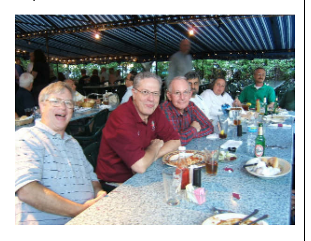
... a great evening for everyone!