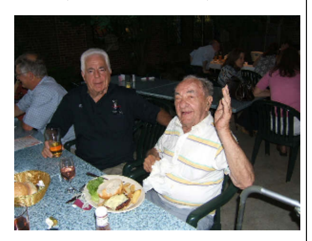
...post contest celebration, and ...