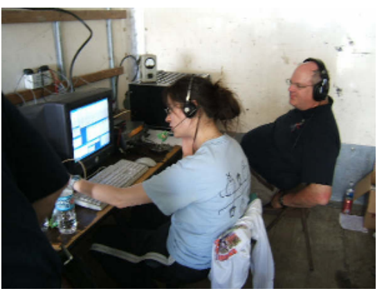
Logging another 432 QSO