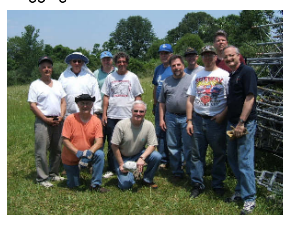
Teardown crew after unloading at Bob's