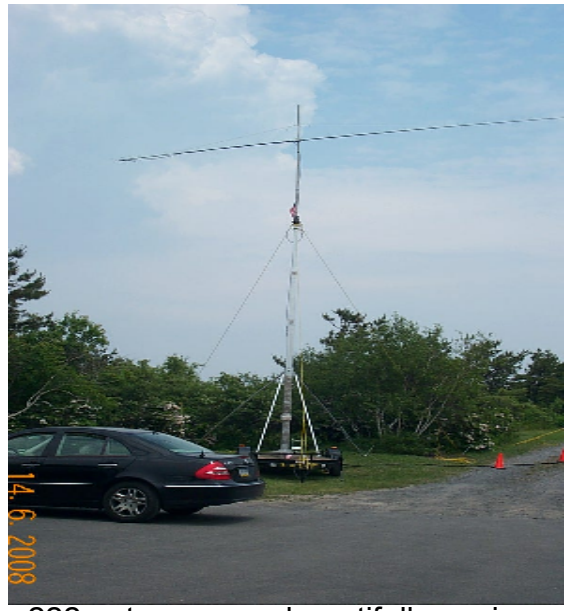
222 antenna on a beautifully engineered trailer tower