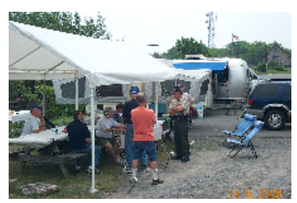
Talking to park ranger while lightning clears the area

There simply wasn't enough room last month to include all the pictures worth showing! Here are a few more.