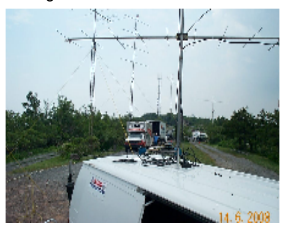
The whole W3CCX antenna farm