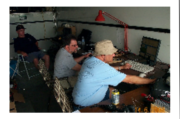
Microwave crew lining up another Q