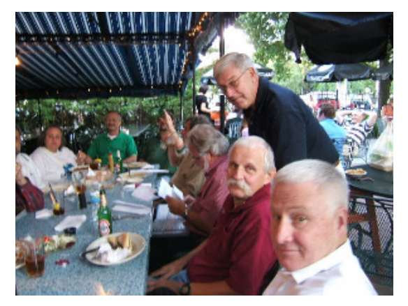
Dinner, election of officers, ...